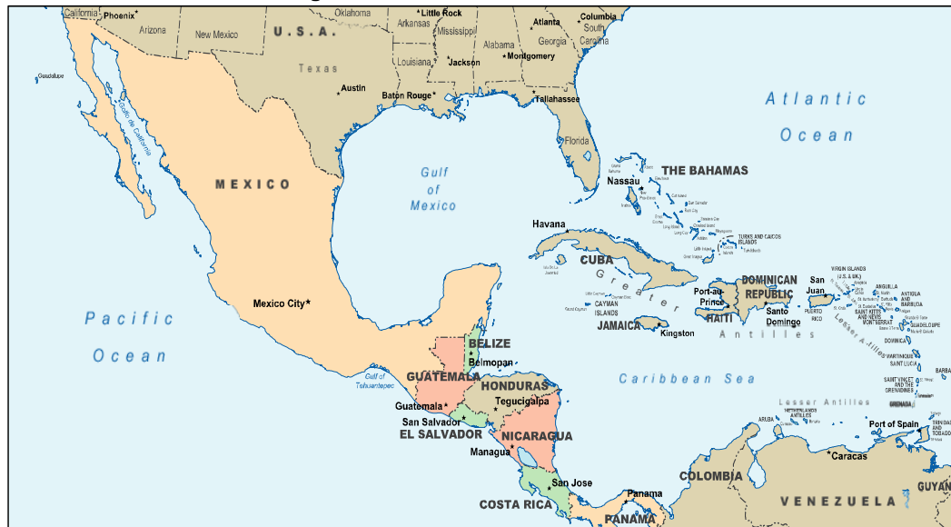
Figure 5. Mexico and Central America

Source: Map Resources. Adapted by CRS. (K.Yancey 4/18/04)