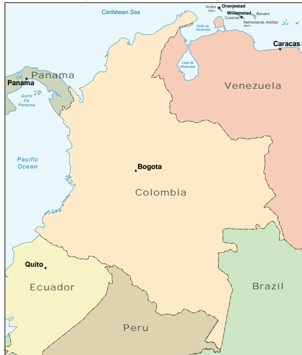
Figure 3. The Andean Region