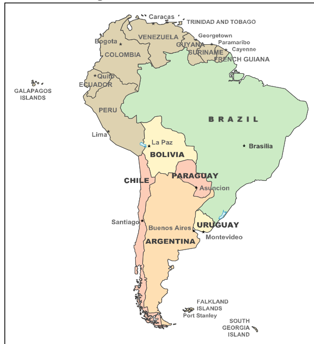
Figure 4. South America